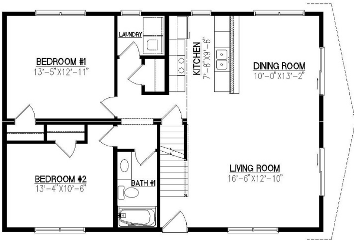
First Floor (w/ Basement)

Note: Renderings are for illustrative purposes only and may vary per series standard specifications.