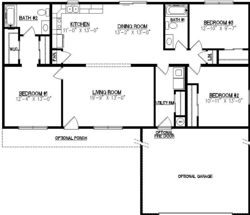
First Floor (w/ Crawl Space)

Ranch 27'-6" x 54'-0" 1485 SQFT 3 Bedrooms / 2 Baths