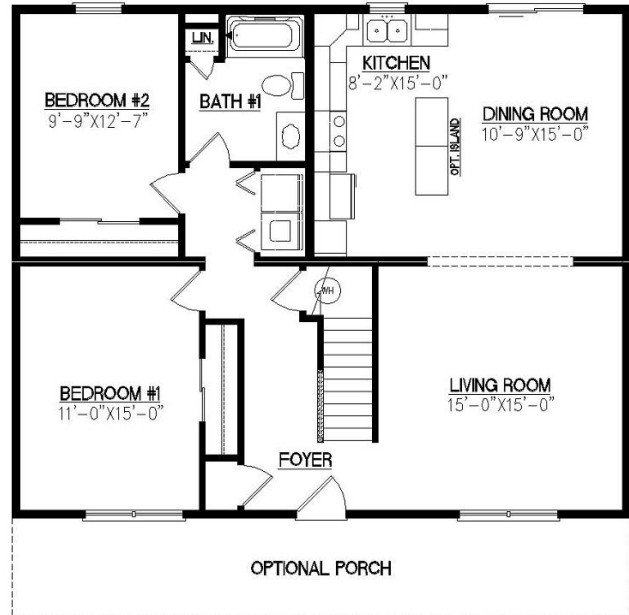
First Floor (w/ Crawl Space)

Note: Proposed second floor available upon request.