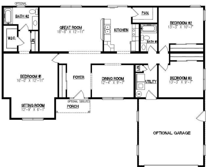
First Floor (w/ Crawl Space)

Ranch 27'-6" x 60'-0" 1732 SQFT 3 Bedrooms / 2 Baths