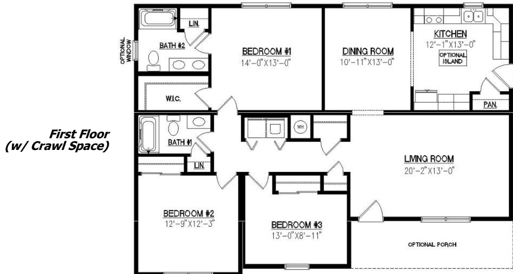
First Floor (w/ Crawl Space)

T-Ranch 34'-6" x 48'-0" 1499 SQFT 3 Bedrooms / 2 Baths